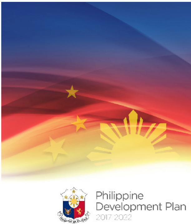
Figure 8. Philippine Development Plan 2017-2022 (GP1.1)

Source: National Economic and Development Authority, the Philippines